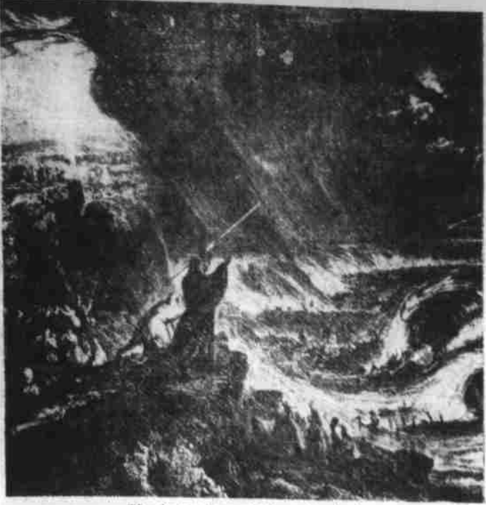
The destruction of Pharaoh's host.

"Thou shalt love Jehovah thy God with all thy heart, and with all thy soul, and with all thy might."—Deuteronomy 6:5.