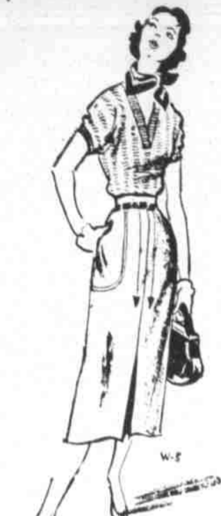
Sweater and skirt. By VERA WINSTON

THE sweater and skirt, that used to be very much on the casual side, has advanced several notches on the fashion scale to become a most attractive and well handled style. Here it is in the very newest version, one that you can see has plenty of appeal. The sweater, which has a hand-made look, is in cherry red, and has a V neck and short puffed sleeves. With it is worn a skirt of fine French flannel in coffee cream brown. It is very slim, with an inverted front pleat that is arrow-stitched on either side. One large pocket, actually slit at the hip, is double stitched. A cherry red leather belt slips through the tabs.