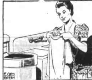
If there are no special washing instructions with a pair nylon garment, handle it as if it were made entirely of nylon.