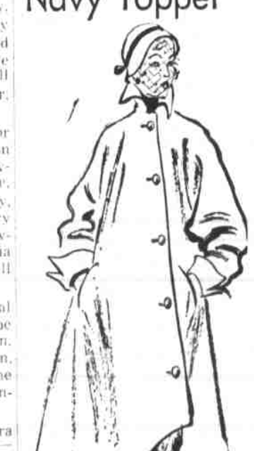
Gabardine and taffeta.