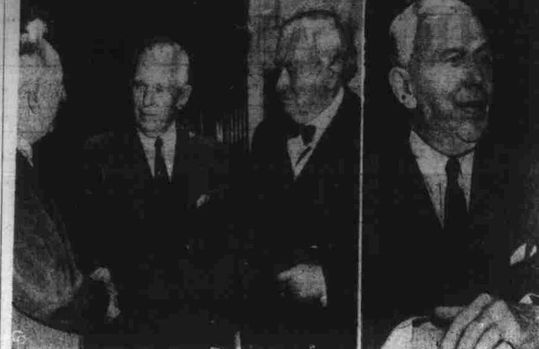
DECLARING THAT THE PROPOSALS OF GEN. DOUGLAS MacARTHUR for a "quick victory" in Korea would risk "all out war with the Soviet Union," Secretary of Defense George C. Marshall testifies (right) before the Joint Senate Armed Forces and Foreign Relations Committee in Washington. Marshall said that Gen. MacArthur was dismissed because, as a local theatre commander, he publicly expressed displeasure with the foreign and military policy of the U. S. At left, Secretary Marshall (center) is welcomed upon his arrival by Sen. Richard B. Russell (left), of Georgia, chairman of the Joint Committee, and Sen. Tom Connally, of Texas, chairman of the Senate Foreign Relations Committee.