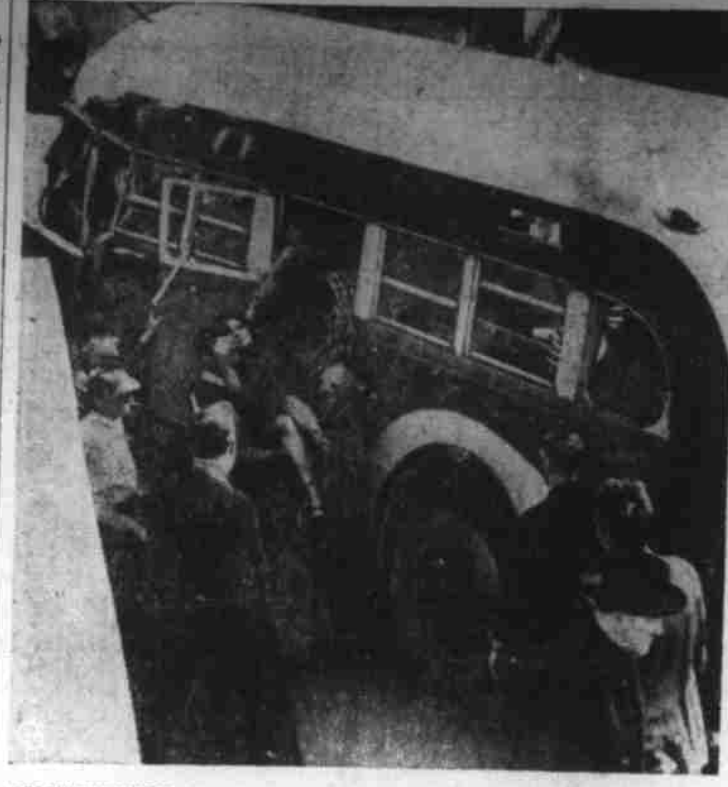
RESCUE WORKERS carry an unidentified woman victim from a runaway bus which crashed into a wall after careening down a mile-long hill near Weirtown, W. Va. Ten persons were killed and 55 Injured. Most of the passengers were on their way to church services.

their cemetery in good shape. They have already moved in. have now started repair work on their church