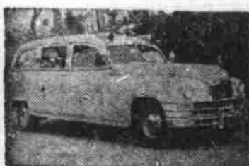
24-Hour Service Crawford Funeral Home Crawford Mutual Burial Ass'n Waynesville, Phone 147 Canton, Dial 3535