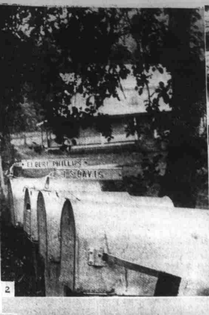
No. 2—The mail boxes on White Oak have attractive name plates, and add much to the appearance of the roadside.