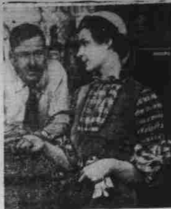
IN "Three Men on a Horse"