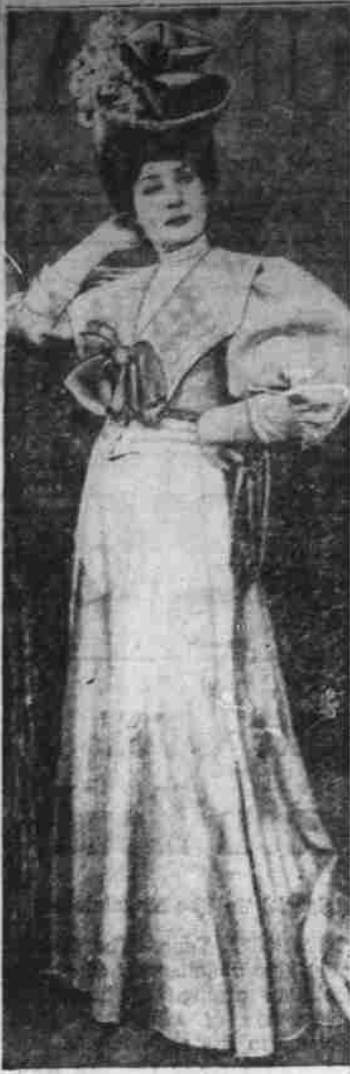
AS CISSY in "A Tree Grows in Brooklyn" Shirley plays a rowdy extrovert with many husbands all called Harry.

PERHAPS THE GREATEST personal triumph of the theatrical season was scored by Shirley Booth when she opened recently in the Broadway musical, "A Tree Grows in Brooklyn." Her portrayal of the easy-going Cissy moved critics to remark that "she can play any role better than anybody." Here are some of her roles: