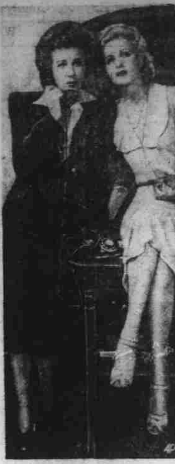
AS RUTH SHERWOOD, bachelor girl in "My Sister Eileen." (L) she won rave notices and played 865 performances.