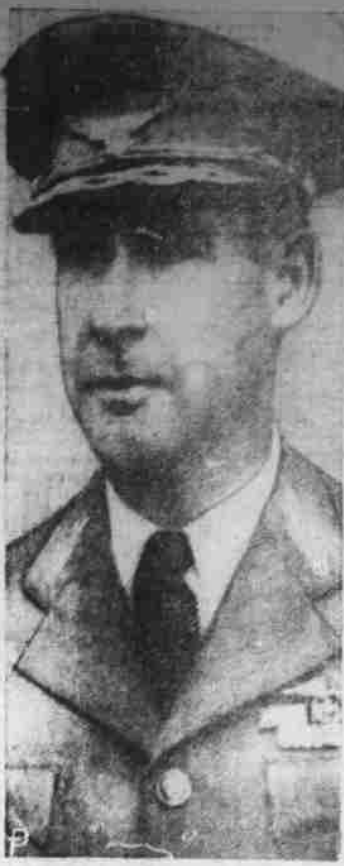
Gen. Francisco Lopes

NO OPPOSITION candidate has yet appeared to challenge Gen. Francisco Cravello Lopes, the National Union Party's choice for President of Portugal. Elections will be held in Mid-July for the post which has been vacant since the death of President Antonio Oscar de Fragozo Carmona last April. (International)