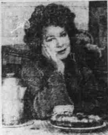
AS A SLATTERN in "Come Back, Little Sheba," she won the critics' award for best performance.