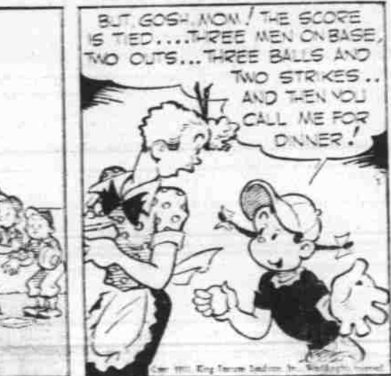
RIGHT AROUND HOME