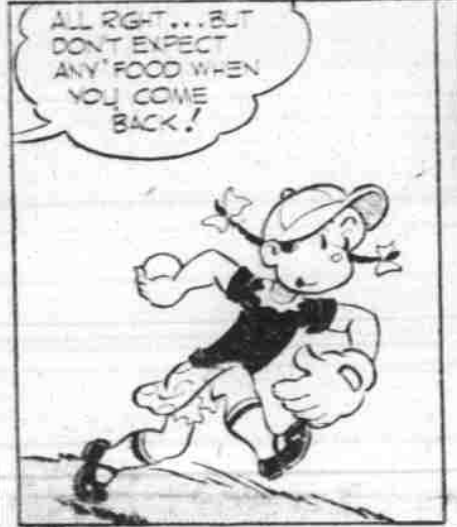
By DUDLEY FINE