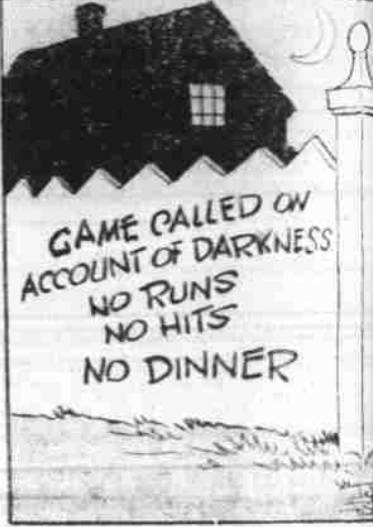
By DUDLEY FINE