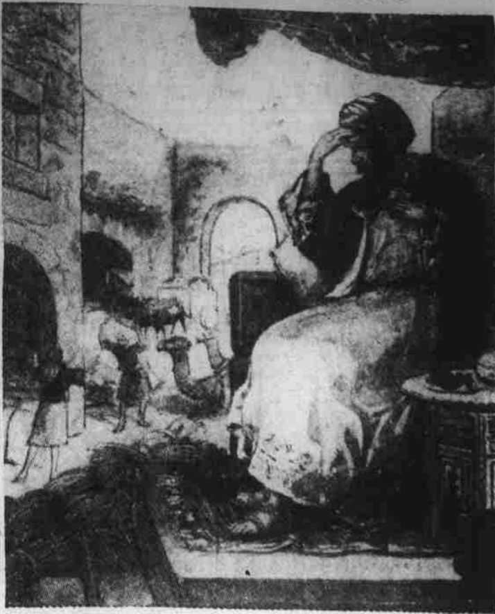
Parable of the rich man who built new barns. "Whatever ye do, work heartily."—Colossians 3:23.