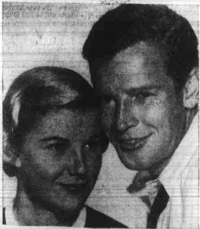
Barbara Bel Geddes and Richard Basehart share the acting limelight with Paul Douglas and Debra Paget in "Fourteen Hours" coming to the Strand Wednesday and Thursday.