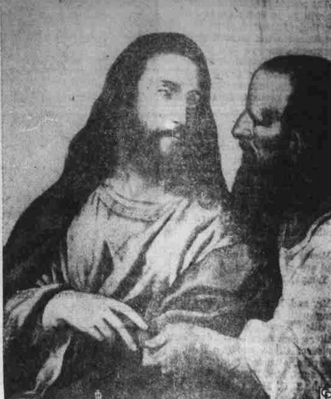
Tribute to Caesar.

"Render unto Caesar the things that are Caesar's, and unto God the things that are God's."—Luke 20:25.