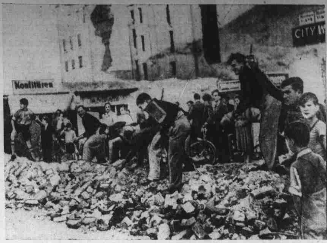
WHEN THE REDS ERECTED NEW STREET BLOCKADES on routes into the western sectors of Berlin in an effort to confine all traffic between the East and West to two main thoroughfares, the West Berliners protested, Here, a group pelts the eastern side of the Berlin border with stones.