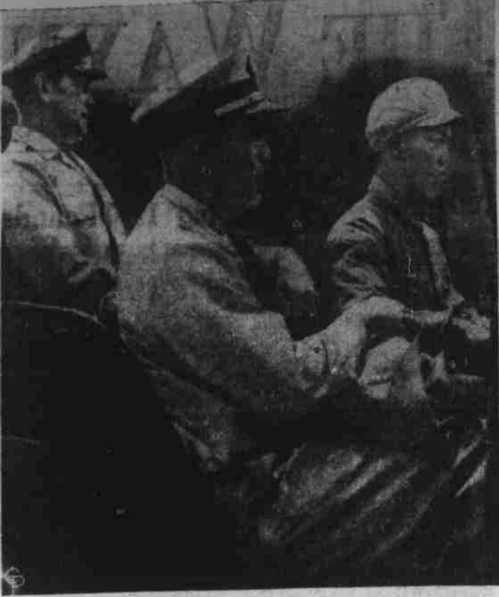
A COMMUNIST JEEP with a Red chauffeur carries Vice Adm. Charles Turner Joy, leader of the U.N. truce delegation, and Maj. Gen. L. C. Craigie (left) to the cease-fire conference sessions at Kaesong. The Reds furnished the transportation for the U.N. delegates, who had to be flown into the area by helicopter after heavy rains had destroyed the temporary spans over the swollen Injin River.