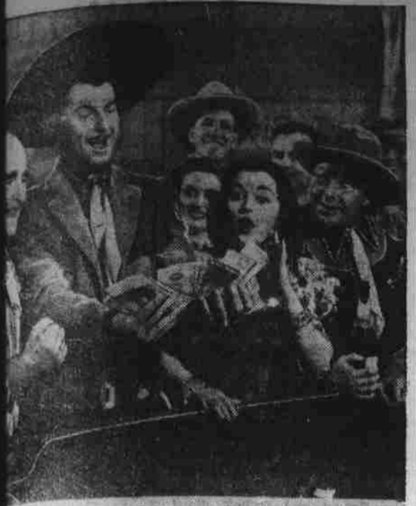
"HIT PARADE OF 1951" (28) Musical hit, with screen and radio personalities playing at Theatre Tuesday and Wednesday.