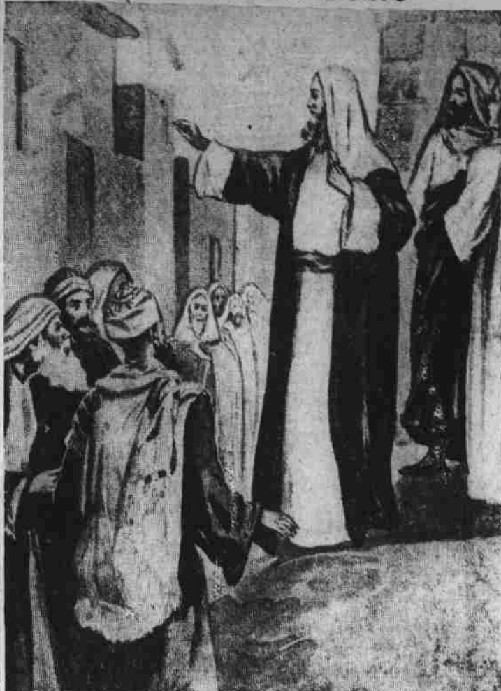
The apostles preaching in Jerusalem.

"Hereby know we love, because He laid down His life for us: and we ought to lay down our lives for the brethren."—1 John 3:16.