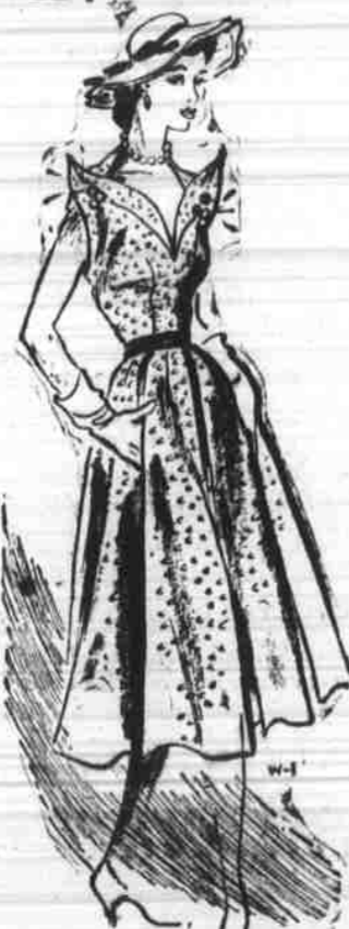
Taffeta afternoon dress.