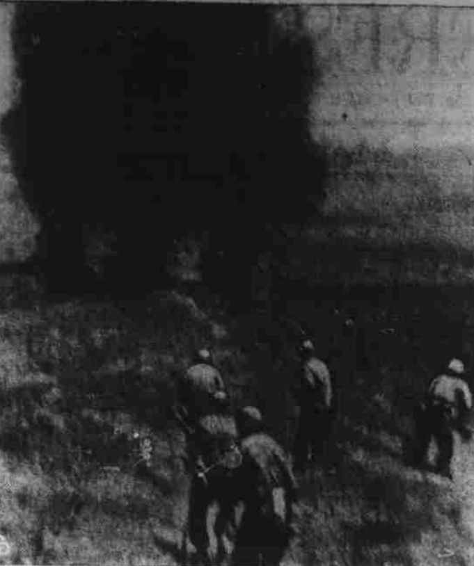
MOVING STEALTHILY AHEAD as the new U.N. counter-attacks get under way in Korea, these members of a patrol of the 8th Cavalry Regiment just miss walking into an enemy shell which explodes ahead of them. The concussion all but knocked the lensman's camera from his hands as he kept pace with the advancing GIs.