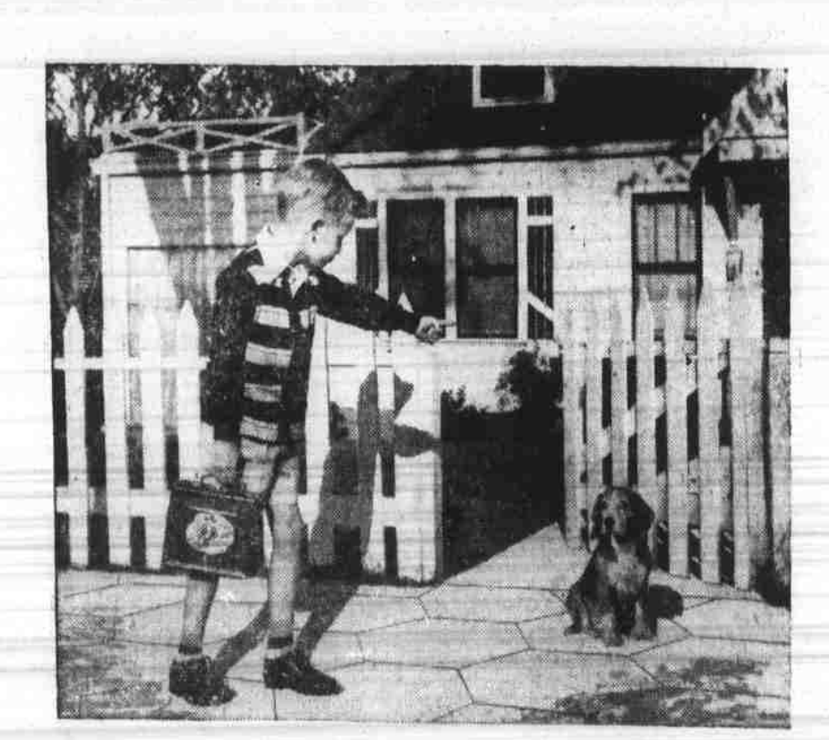
GROWING UP IN THE SOUTH

Located on Lake Logan Road — 1 Mile Above Bethel