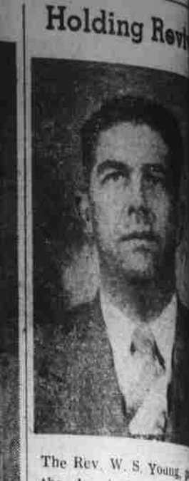
the Junaluska Baptist has started a series of services which will through Sunday. Servi held every evening at 17 with special singing plan