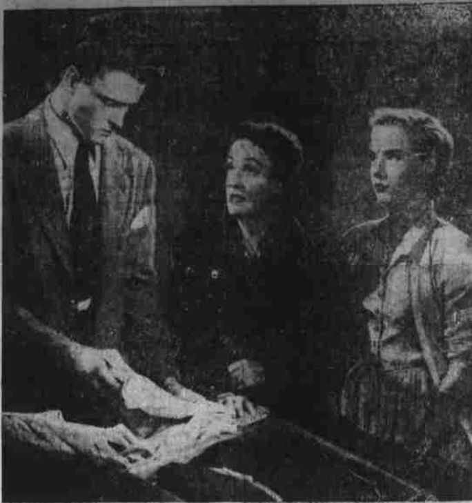
Determined to free himself from the over-possessive family who have helped ruin his marriage, John Ericson leaves his mother, Patricia Collinge, and sister, Peggy Ann Garner, in this scene from "Teresa," stirring M-G-M drama, showing at the Strand Theatre Tuesday and Wednesday.