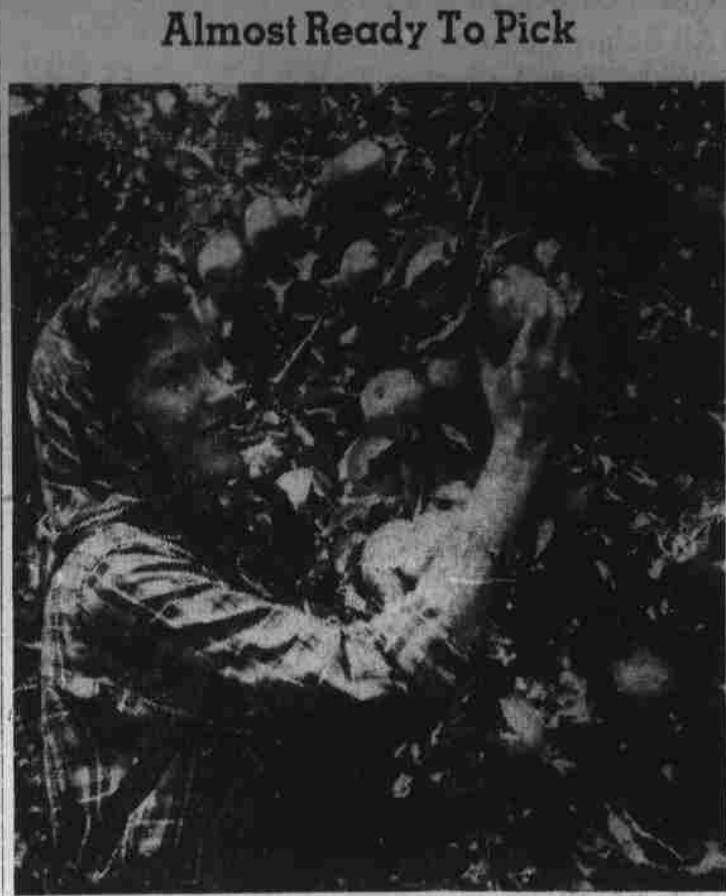
Apples are hanging heavily on the tree and their beauty, their color, their perfume demand a closer examination. But they are not quite ready to be eaten.

Four Minerals: Anti-Anemic: 7. The apple provides a supplemental source of calcium, phosphorus, iron and copper. The iron and copper alone are sufficient to