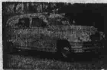
24-Hour Service Crawford Funeral Home Crawford Mutual Burial Ass'n Waynesville, Phone 147 Canton, Dial 3535