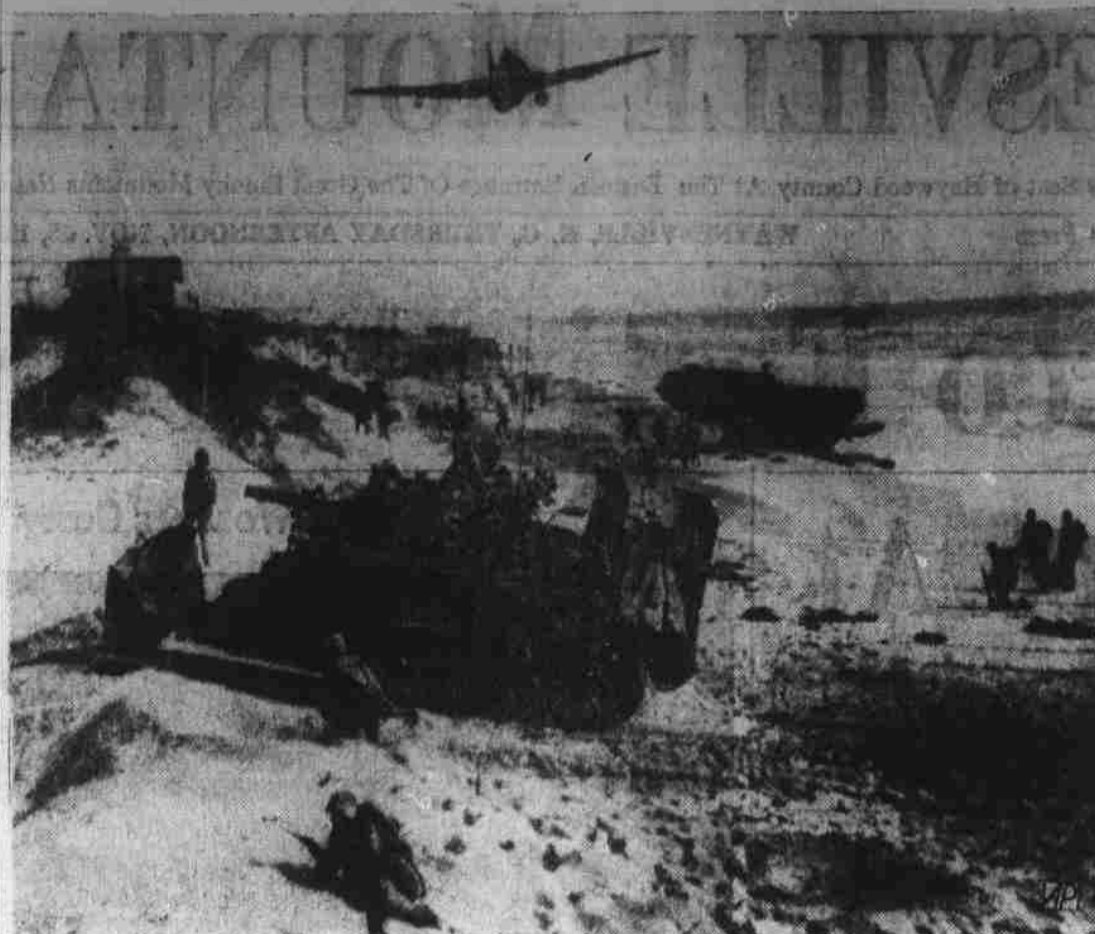
Second Division Marines establish a beachhead on the Atlantic shore at Onslow Beach, N. C., in an amphibious invasion as a climax to maneuvers involving 120,000 men and 200 ships. A fighter plane flies over the men, landing craft and tanks on the beach.