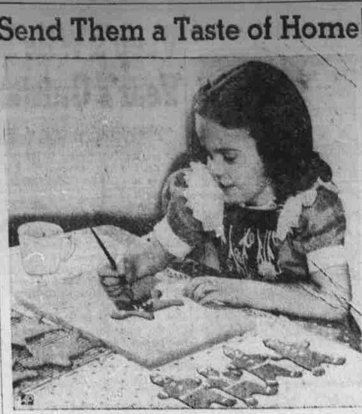
GINGERBREAD MEN . . . Let youngsters help make them.

Send Them a Taste of Home GINGERBREAD MEN . . . Let youngsters help make them. COCONUT FIG BARS . . . Taste treat for that serviceman. By CECILY BROWNSTONE Associated Press Food Editor There's still time to send a serviceman in this country a homey box of holiday cookies. Bar cookies, enriched with coconut and figs, are easy to pack. If there's a youngster in your family she'll enjoy making some gingerbread men to tuck in. COCONUT FIG BARS Ingredients: 1 1/4 cups sifted cake flour, 1/2 teaspoon double-acting baking powder, 1/2 teaspoon salt, 2 eggs, 1 cup sugar, 1 tablespoon melted butter or margarine, 3/4 cup finely cut figs, 1 teaspoon grated lemon rind, 1 cup shredded coconut, 1 tablespoon hot water. Method: Sift together flour, baking powder, and salt. Beat eggs well; beat in sugar gradually and thoroughly. Mix in butter or margarine, figs, lemon rind, and coconut. Mix in flour, alternately with water. For a thin, chewy bar, spread mixture in two greased 8 x 8 x 2-inch pans and bake in slow (325 F.) oven about 30 minutes. For a thick, drier bar, spread in one