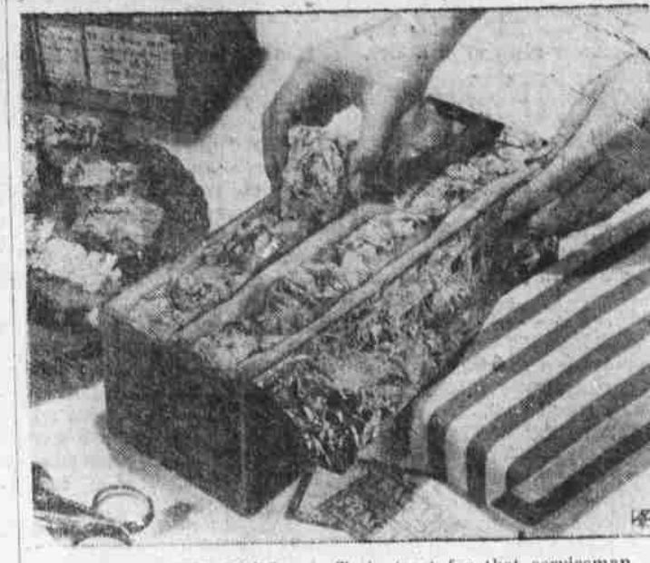
COCONUT FIG BARS . . . Taste treat for that serviceman.

greased 9 x 9 x 2-inch pan and bake at 325° F. about 35 minutes. Cool and cut in 2 1/2 x 1 1/4-inch bars. Remove from pans. Makes 3 dozen thin bars, or 1 1/2 dozen thick bars. GINGERBREAD MEN Ingredients: 2 1/2 cups sifted all-purpose flour, 3/4 teaspoon baking soda, 1/2 teaspoon salt, 1/2 teaspoon allspice, 1/2 teaspoon ginger, 1/2 teaspoon cinnamon, 1/2 cup vitaminized margarine, 1/3 cup sugar, 1/3 cup dark molasses, 1/3 cup water. Method: Sift together flour, baking soda, salt, allspice, ginger, and cinnamon. Cream margarine and sugar. Mix molasses and water together and add to creamed mixture alternately with flour. Roll dough into a ball and chill thoroughly. Roll dough out to 1/8-inch thickness and cut with a gingerbread man cookie cutter. Place on a greased cookie sheet and bake in a moderately hot (375° F.) oven 12 to 15 minutes. Remove from pan immediately and cool. Decorate gingerbread men with sugar frosting made by mixing 1/2 cup confectioners' sugar with 1 1/2 to 2 tablespoons water.