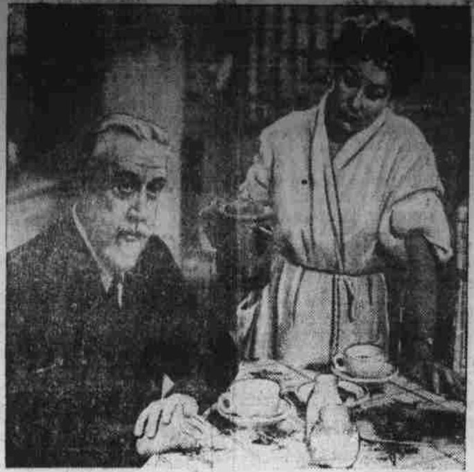
Thelma Ritter tries to console Monty Woolley about being retired just because he has turned 65 in a scene from Twentieth Century-Fox's new comedy "As Young As You Feel" coming Tuesday to the Strand.