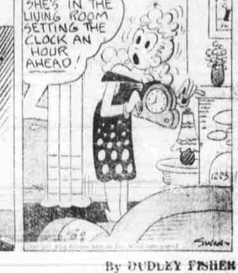
RIGHT AROUND HOME