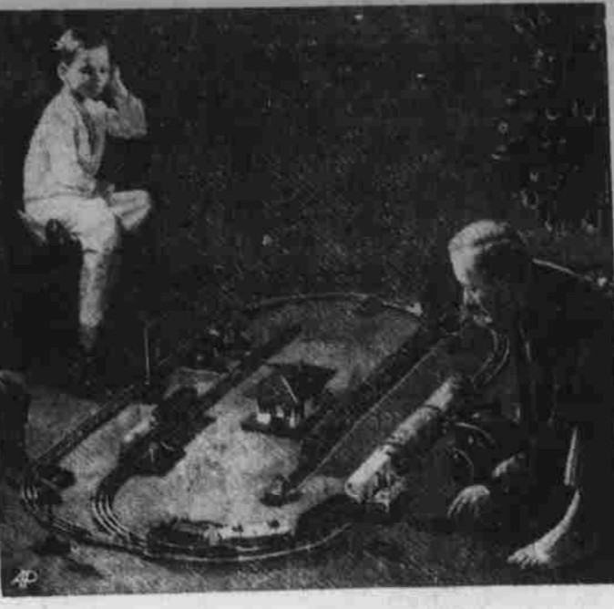
PAPA KNOWS BEST . . . And Junior must wait his turn to take the controls of that new electric train.

It's a safe bet that Pop is going to be the first one playing with that new electric train on Christmas morning.