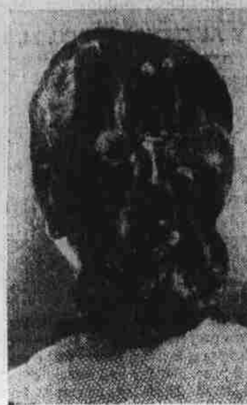
BACK INTEREST . . . Tortoise shell "Clincher" keeps hes hair pinned back,

HOLLWOOD-"Fixed Bayonets!" like real dogfaces.