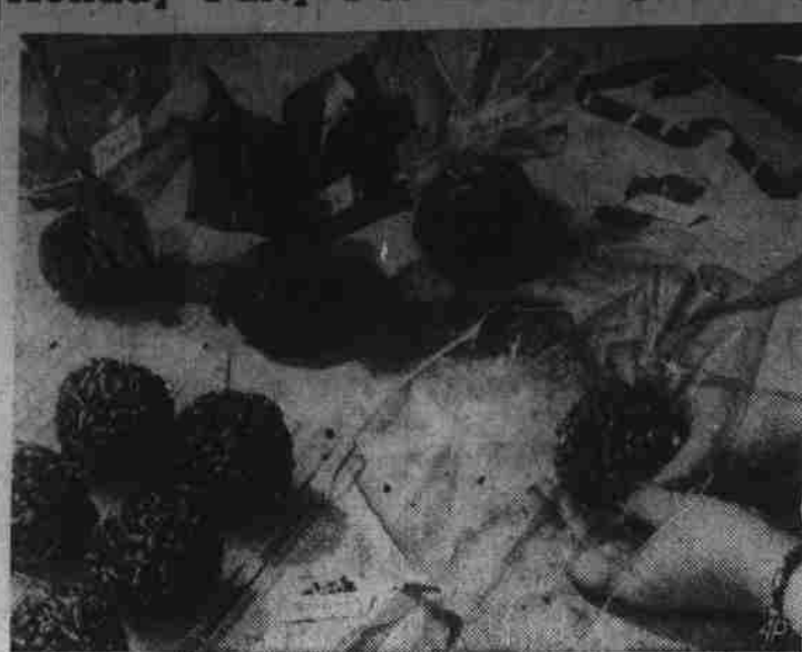
CANDY BALLS... Attach place cards for small fry.