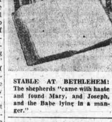
STABLE AT BETHLEHEM: The shepherds "came with haste and found Mary, and Joseph, and the Babe lying in a manger."

Try to give the poinsettia the sunniest spot available. It is wise to fertilize it occasionally with a good commercial food tablet.