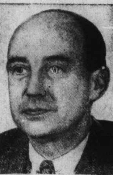
ADLAI E. STEVENSON