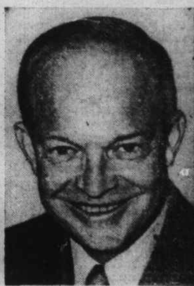
DWIGHT D. EISENHOWER

After spirited Conventions in Chicago, the nation's two major political parties have chosen the above men as their representatives in the Nov. 4 elections. Gov. Adlai Stevenson and Senator John Sparkman will head the Democratic ticket. General Dwight Eisenhower and Senator Richard Nixon were chosen by the GOP as its candidates.