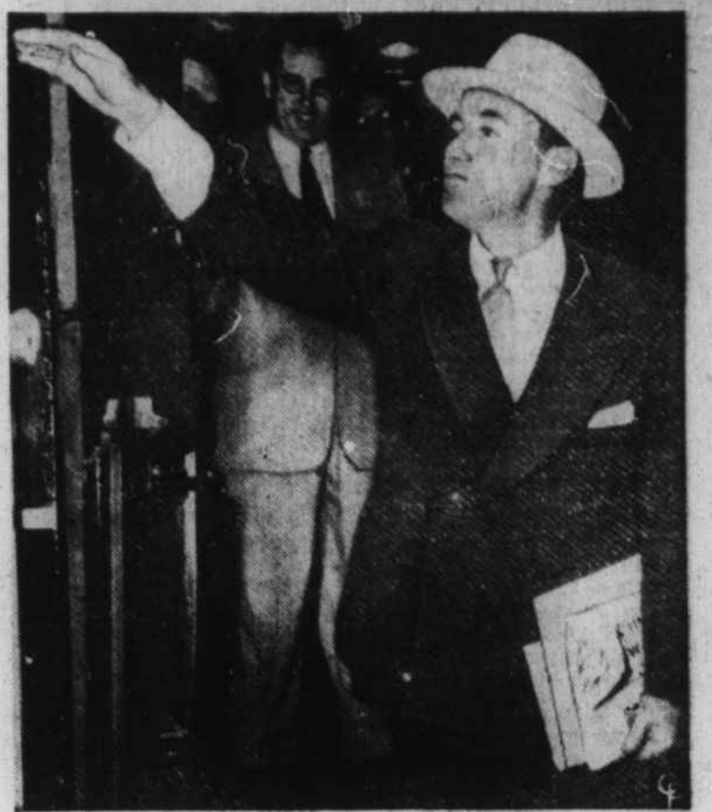
JUST BEFORE he boards a train in Chicago, Gov. Adlai Stevenson waves to well-wishers. The Democratic Presidential candidate was leaving for Springfield to clear up state business before taking a short rest, after which he will launch his campaign.