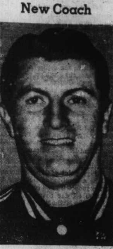
Frank McGuire (above), resigned as basketball coach at St. John's University in Brooklyn, N. Y., to accept a similar position at the University of North Carolina. In five years at St. John's McGuire's teams have won 103 games while losing only 35.