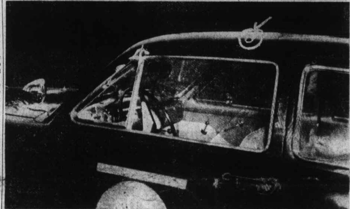
The photo at the top shows where a rifle bullet went into the top of a Highway Patrol car, driven by Patrolman W. R. Wooten, near the eastern Canton city limits shortly after noon Sunday. The lower picture shows where the bullet left the car, just an inch or so above the driver's head. The bullet made a hole about the size of a dime going in, and the opening where it came out was about the size of a quarter..