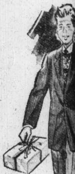
Corduroy sport coat. Brown or maroon, all sizes.

Smart, practical gift "little he-men" go for in way! Come see our tremendous selection of gift-wearable active boys.