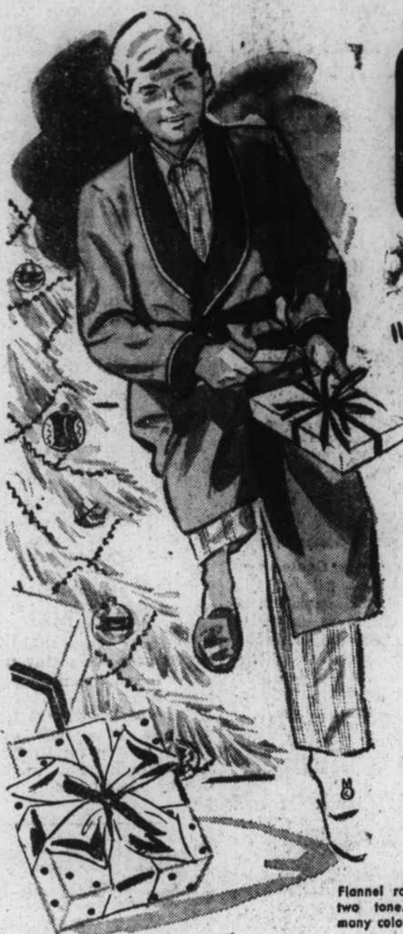
Flannel robe, solid or two tone. All sizes, many colors.

Smart, practical gift "little he-men" go for in way! Come see our tremendous selection of gift-wearable active boys.