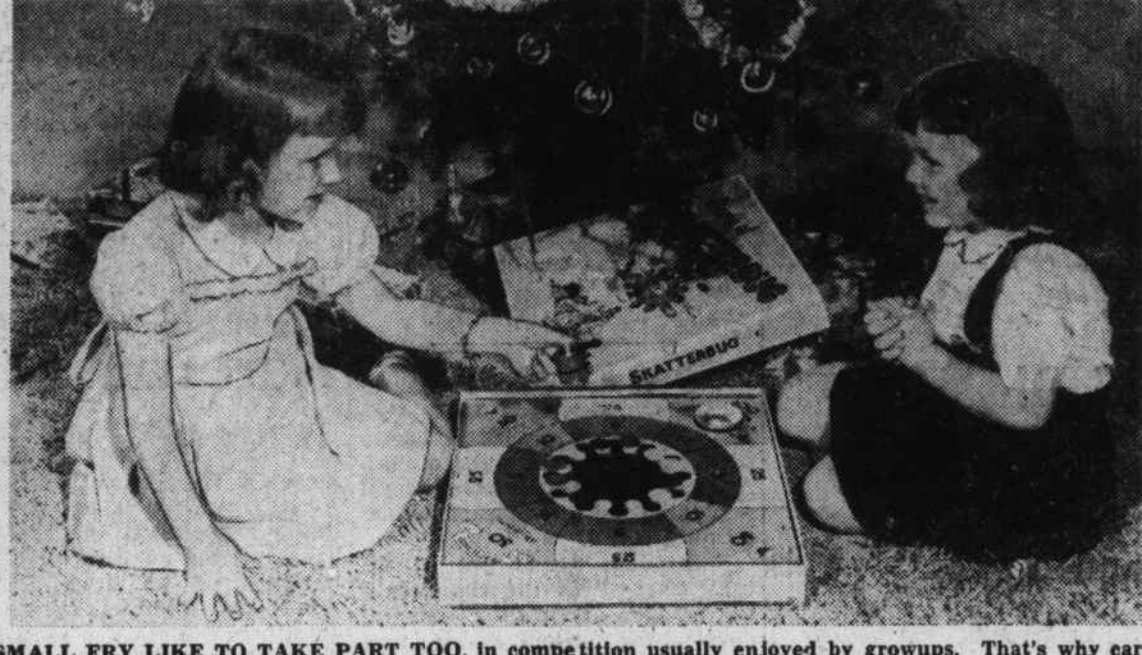
SMALL FRY LIKE TO TAKE PART TOO, in competition usually enjoyed by growups. That's why care fully chosen games make such popular and successful Christmas gifts for children, says the American Tox Institute. These youngsters are playing with a Skatterbug set, especially appealing to pre-schoolers, is by Parker.

Add cheer at Christmas time! Lay away a gift a day. Make A most desirable gift for the pianist on your list is sheet music. offered.