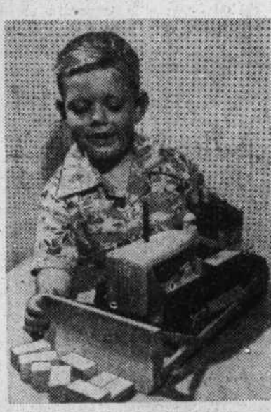
BULLDOZER TO THRILL small fry, is replica of the real thing. Treads operate independently. By Doepke. Suggest by American Toy