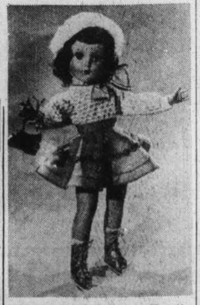
QUEEN OF WINTER is Nanette, pert skating doll, dressed in her tiny knit sweater, fur cap and gold skates. By R & B.