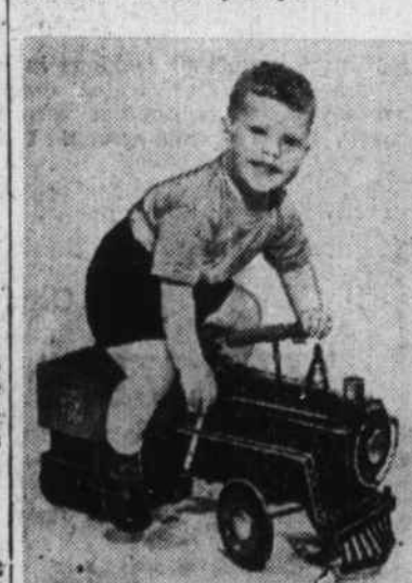
RUBBER TIRED Locomotive for young engineers to ride at will. True to life model by Keystone. Guidance

YOUNG SPACE MEN will increase in numbers as equipment such as the Flash Gordon Outfit pictured above invades Toyland this year with "out of this world" gadgets, says the Toy Guidance Council. Made by Esquire.