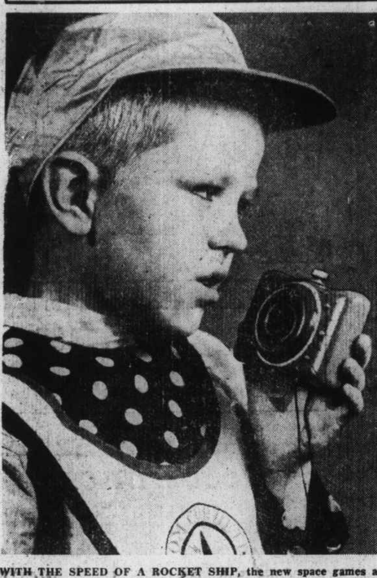
WITH THE SPEED OF A ROCKET SHIP, the new space games are rushing into favor among the young folk this year, symbolized, says the Toy Guidance Council, by the handsome young lad above so seriously intent on dispatching a message over his Two-Way space phone, which actually works. It is by Zany,