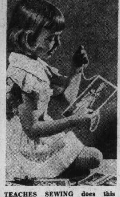
TEACHES SEWING does unique variation of paper doll cutouts called Sew-on-Cards. Pre punched holes eliminate need of scissors. Has dress assortment. By girls four to eight, by Toy Guid-

All in all it appears that Santa's toy pack will be crammed full of For sheer feminine excitement, exciting playthings for children of give her an armful of bangle brace- all ages and interests. Melvin