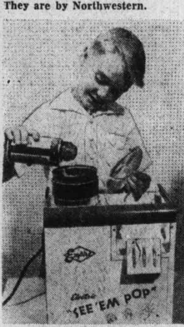
BUSINESS LIKE, is this corn popper which the youngsters can operate with ease and fun, says the American Toy Institute. Designed like the movie equipment, it is by Metal Ware.