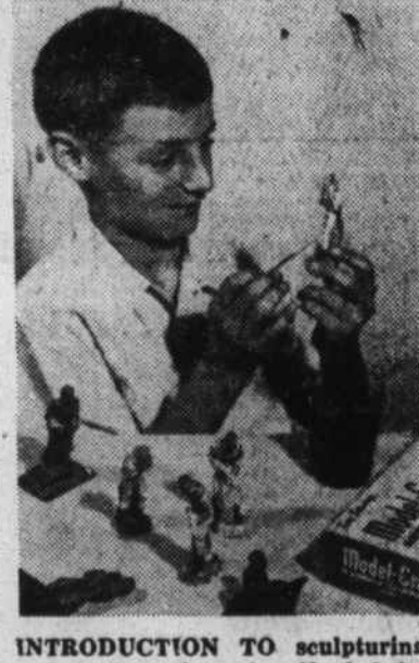
INTRODUCTION TO sculpturing and water colors, is afforded by modeling and coloring sets that will delight creative youngsters. This set by Model-Craft,