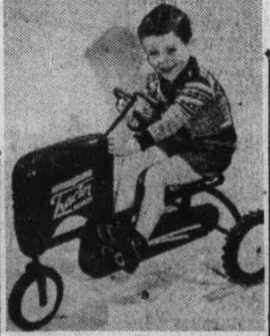
ideal gift to teach the young how to extend kindness and give care lucky enough to get this velocipede Add to your "pet gift" acces disguised as a tractor, will discover sories-collar, leash or basket bed. when they get it for Christmas, sug-But, be sure to check first with gested the Toy Guidance Council