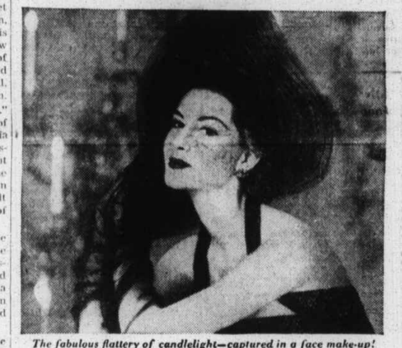
The fabulous flattery of candlelight—captured in a face make-up!

Fabulous new face make-up that actually beauty-treats your skin!