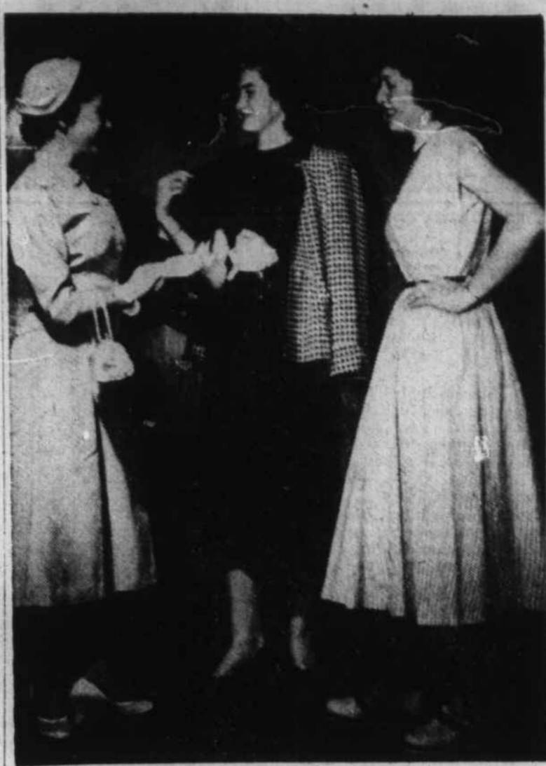
Three of the young ladies who will model clothes from Massie's Department Store Tuesday night at the Strand Theatre...