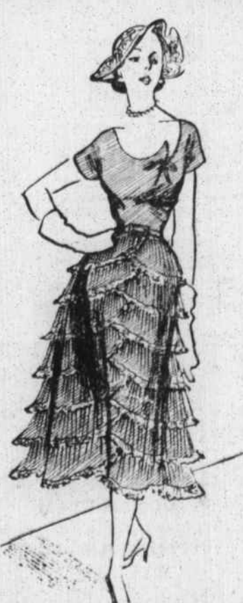
By VERA WINSTON

BACK again with us and very welcome too is the soft, feminine, one-piece frock, a nice choice for dressy occasions during the months ahead. Gray sheer with white lace is used for this one, which would be nice in navy with pink as well. The low, round neck is slashed a little at one side where a string bow is perched. The skirt consists of tier upon tier of pleats edged in lace, criss-crossed current fashion. The silhouette bells towards the hem. This is a good wedding guest choice.