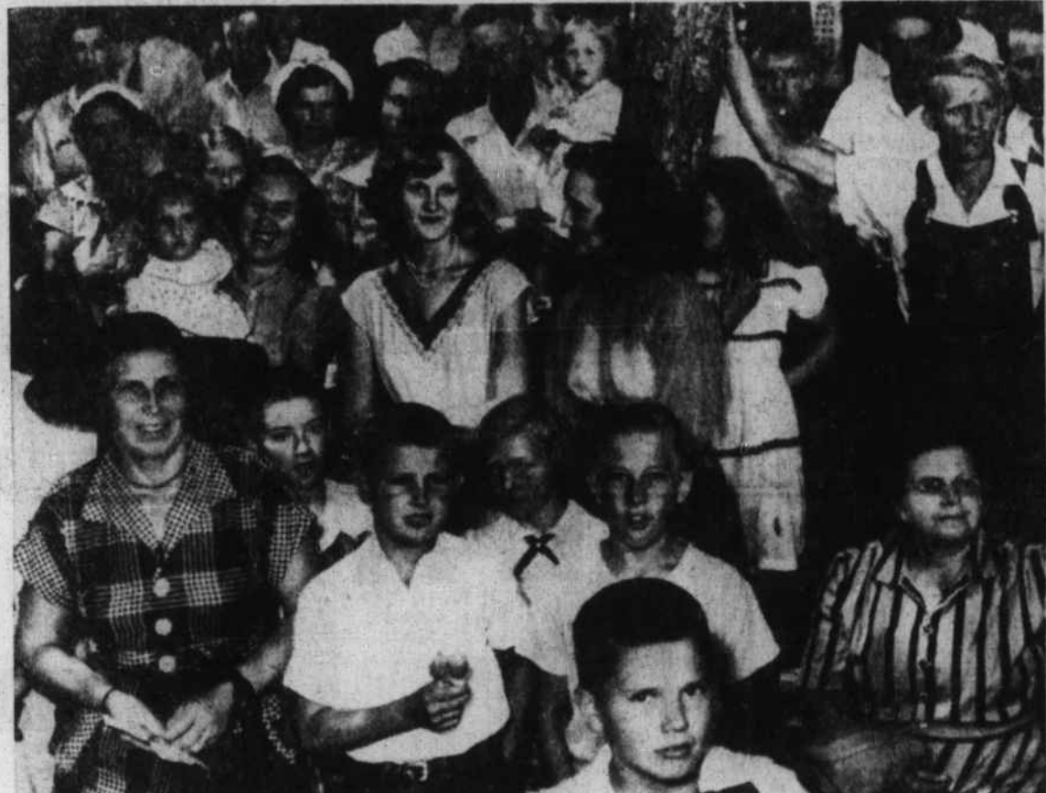
SOME OF THE CROWD at last year's gathering.

Small fry love toasted bread cubes in a cream soup, under a poached egg or as a base for creamed vegetables, meat or fish. To prepare the cubes, cut soft bread into small squares. Arrange the cubes on a cookie sheet and place in a slow oven; turn the bread occasionally and toast until golden brown on all sides.