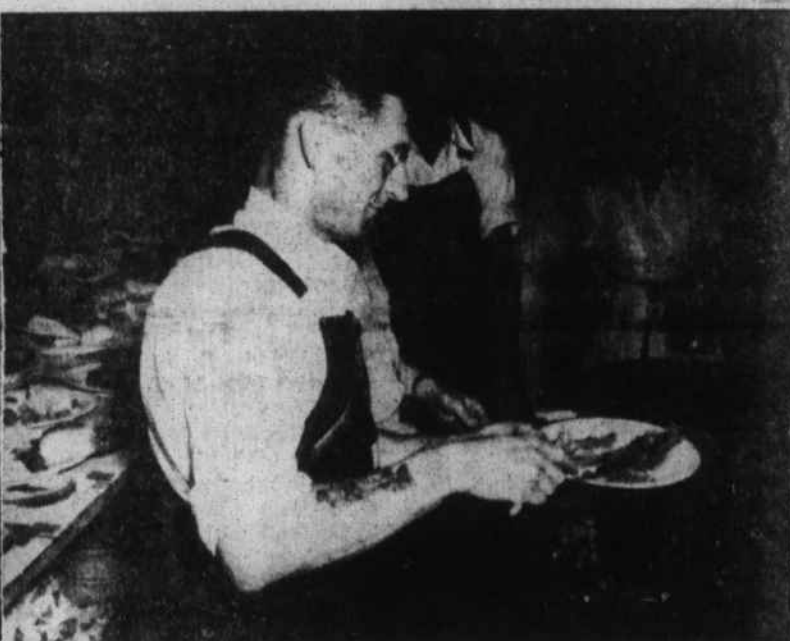
TIME OUT for lunch. Come and get it!