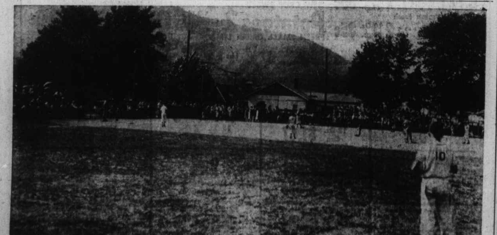
LARGE CROWD attended both the tournament games of the tle League at the Hazelwood playground-Tuesday and Wed-

The peripatus, which looks like a hig worm, apparently has survived the age of dinosaurs because it lives hidden under rotting logs.