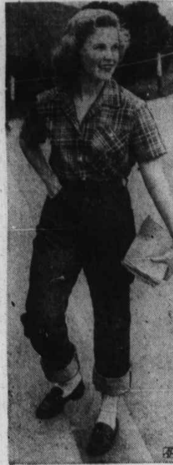
WRANGLER JEANS... Hep school girls insist on tight fit, slim legs, copper rivets.