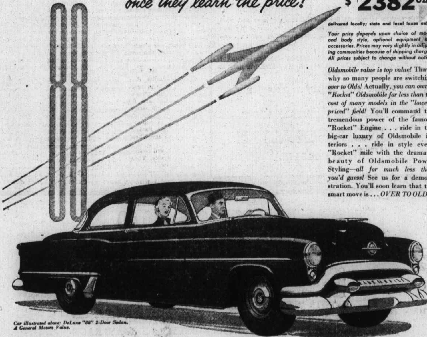
Car illustrated above: DeLuxe "68" 2-Door Sedan. A General Motors Value.

Oldsmobile value is top value! That's why so many people are switching over to Olds! Actually, you can own a "Rocket" Oldsmobile for less than the cost of many models in the "lowest-priced" field! You'll command the tremendous power of the famous "Rocket" Engine . . . ride in the big-car luxury of Oldsmobile interiors . . . ride in style every "Rocket" mile with the dramatic beauty of Oldsmobile Power Styling—all for much less than you'd guess! See us for a demonstration. You'll soon learn that the smart move is . . . OVER TO OLDS!