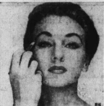
STEP THREE . . . Apply eyebrow pencil in feather-like stroke to your brows.