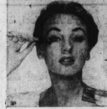
STEP FOUR . . . A damp mascara brush is best for lashes' naturalness.