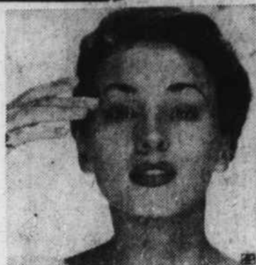
STEP ONE . . . Eye shadow is blended outward from center of the eyelid.

4. Apply mascara with a not-too-wet brush, beginning at base of lashes and swooping upward. After lashes dry, a clean dry brush should be used to separate hairs and remove surplus mascara. Apply another coat of mascara, and wait a little longer for it to dry. Go over it with a clean dry brush.