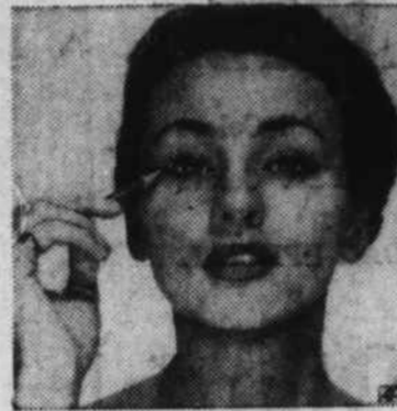
STEP TWO . . . Draw a line at lashes base of both upper and lower lids.