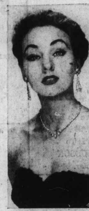
STEP FIVE . . . Glamor orbs are the result of a careful makeup technique.