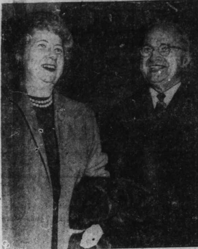
FORMER PRESIDENT Harry S. Truman and his wife are shown on their arrival at New York, where the ex-Chief Executive came to receive the Stephen S. Wise Award from the American Jewish Congress. Composed and ready to answer all questions from reporters, Truman evinced no concern over charges by Attorney General Herbert Brownell that he promoted Harry Dexter White to a top government job after being twice told by the FBI that White was a Red spy.