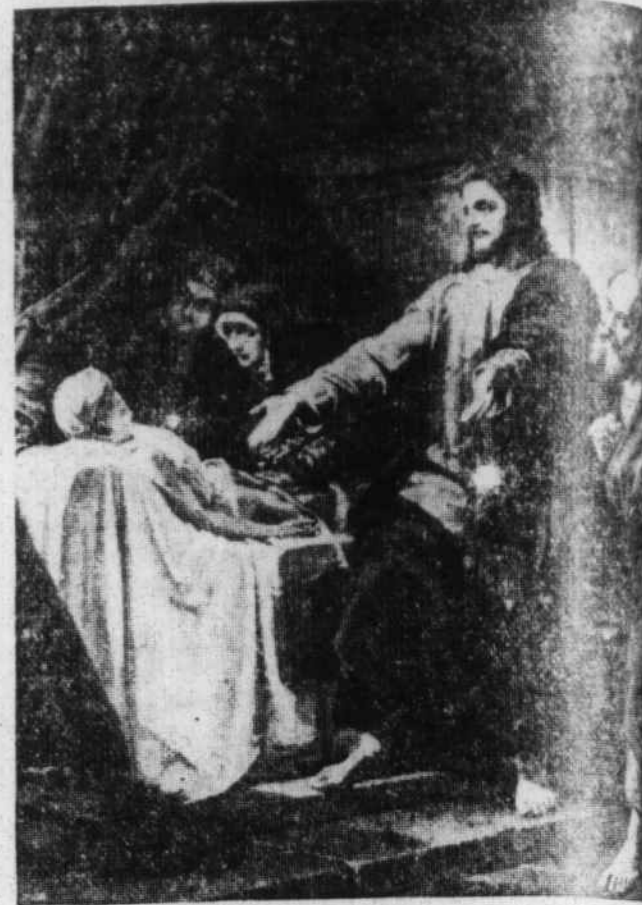
Christ raising the daughter of Jairus. "I am come that they might have life, and that they might have it more abundantly."—John 10:10.