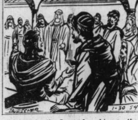
Accused by the Jews of working on the Sabbath because He healed the cripple, Jesus answered them, "My Father worketh hitherto, and I work... MEMOY VERSE—John 10:10