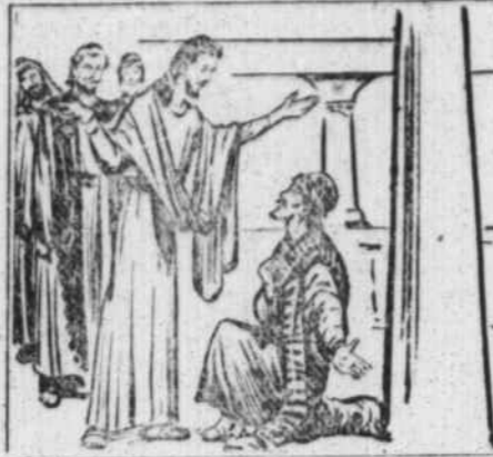
In Cana, where Jesus turned the water into wine at the marriage feast, a nobleman came to Him, asking Him to heal his son who was near death. Jesus said to him, "Go thy way; thy son liveth."