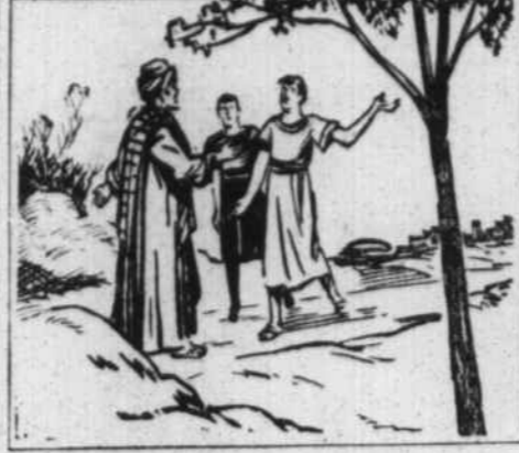
As the nobleman neared home after Jesus told him his son would live, his servants met him and told him the son was alive, and that he began to recover at the hour Jesus said he would live.