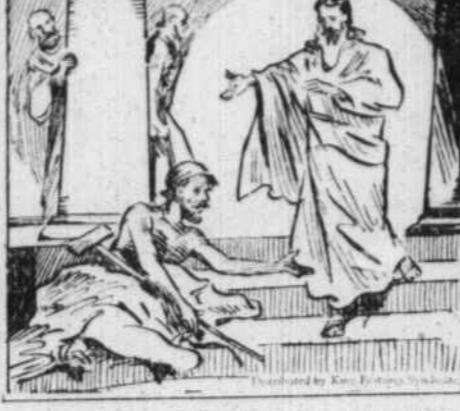
At the pool of Bethesda, in Jerusalem, many blind, halt and withered were waiting for the healing waters to be stirred. A crippled man was told by Jesus to "Rise, take up thy bed and walk."