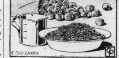
One pound of pecans in the shell make almost 1 1/2 cups shelled.