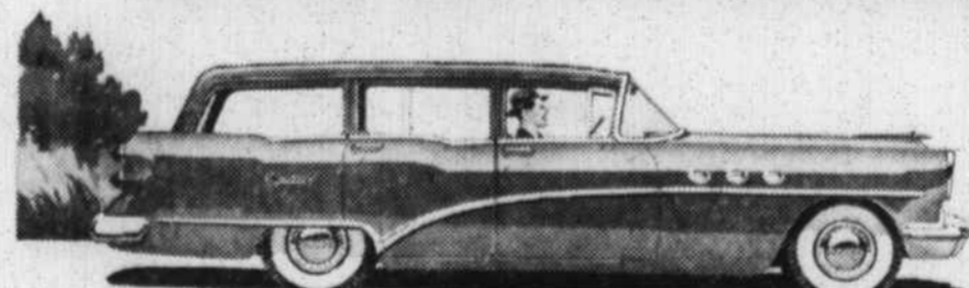
The sensational Buick Century is available for 1954 in a full line of models, including the completely new all-steel 4-door, 6-passenger Estate Wagon shown here.

(horsepower) 200 HP makes BUICK's CENTURY the power buy of the year!