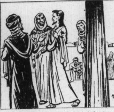
Walking in Solomon's porch of the temple, Jesus' enemies asked Him to tell them if He was indeed the Christ. He said He had told them so but they believed not. They would have stoned Him.