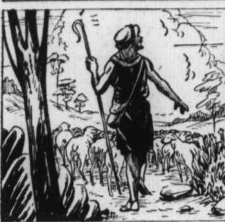
The good shepherd knows his sheep by name and they know his voice and will follow him when he leads them out to pasture. And he will lay down his life for his sheep, Jesus said.