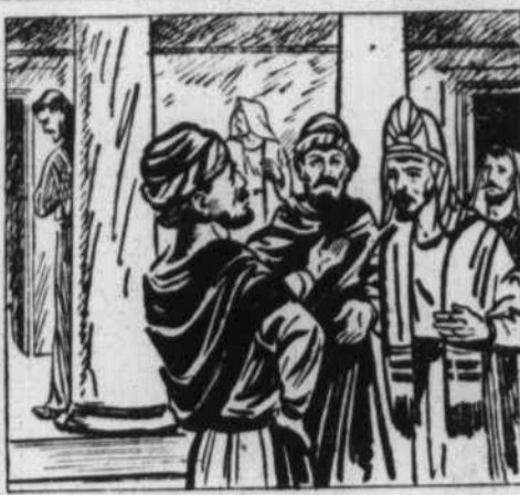
Jesus said He was the good shepherd who would lay down His life for His sheep. Some said He was a devil and mad; others declared He could not be a devil for He made the blind see.