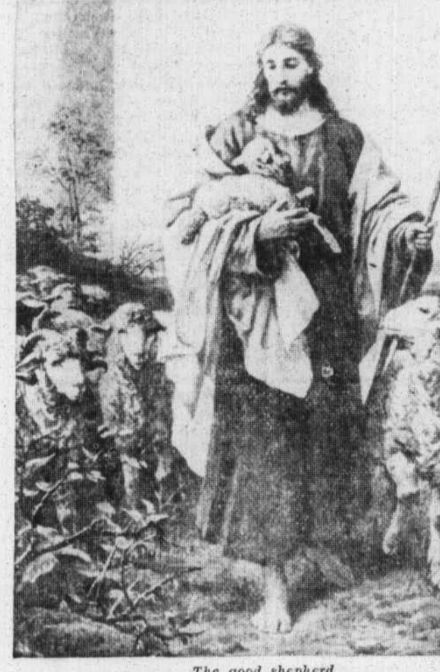
"Other sheep I have, which are not of this fold: them also I must bring, and they shall hear My voice, and there shall be one fold, and one shepherd."—John 10:16.

Jehovah's Witnesses Kingdom Hall 107 1/2 Main St. Waynesville SPECIAL NOTICE There will be no Studies at our Kingdom Hall this week, Friday, Saturday or Sunday, February 26-28, as we are having our Semi-annual Circuit Assembly. We wish to extend a warm welcome to all people in this area who are sincerely interested in Bible instruction and who have prayed as Christ Jesus taught us to at Matt. 6:9, 10, "Our Father, hallowed be your name. Your Kingdom come. Your will be done on Earth as it is in Heaven." This shows we desire to remain here on the earth to enjoy our life under righteous Rule, just as the apostle Peter wrote at 2 Peter 3:13. There will be ample parking space, so come and join us in a real honest Christian Worship of the great God whose name alone is Jehovah PS, 83:18. Modern Berlin includes 341 square miles.