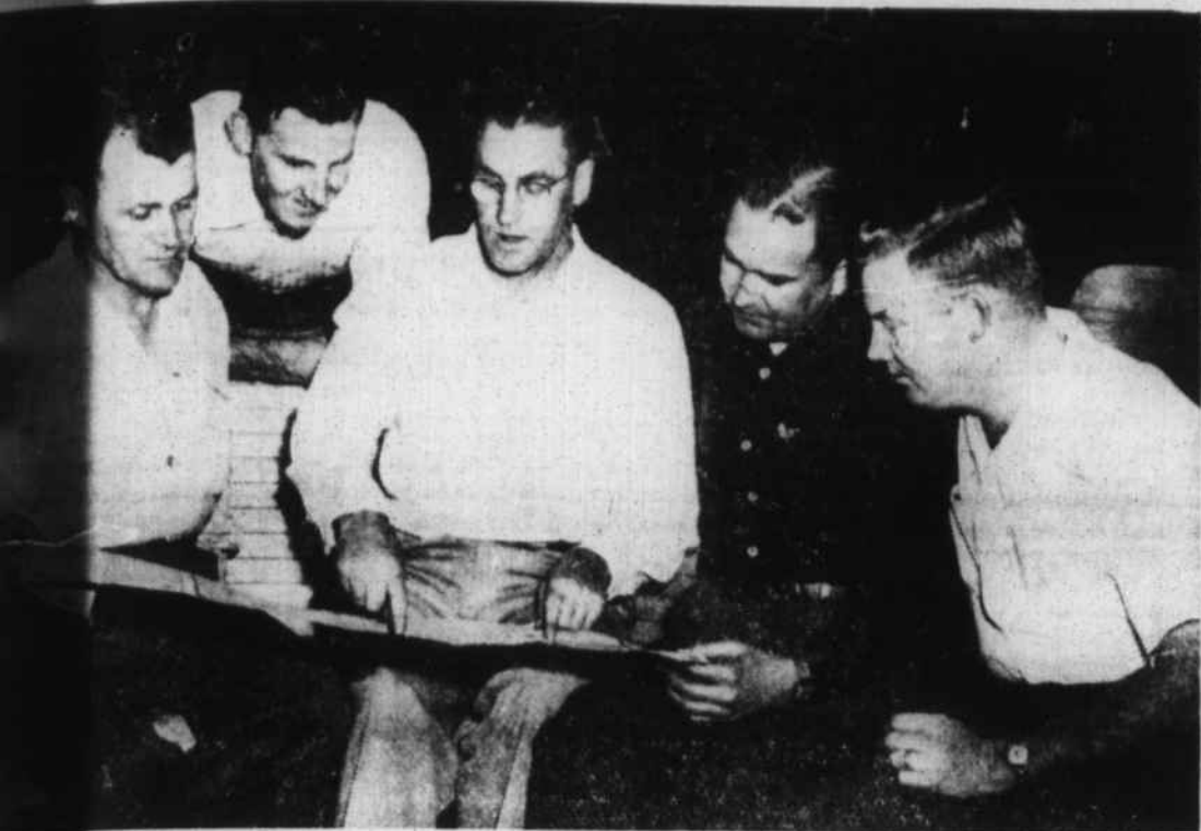
ON ROUGE BOUND are these keglers who represent the Waynesville Bowling Center at Southern Regional Invitational Bowling Tournament in the Louisiana capital this weekend. They are looking over a road map to pick the best route