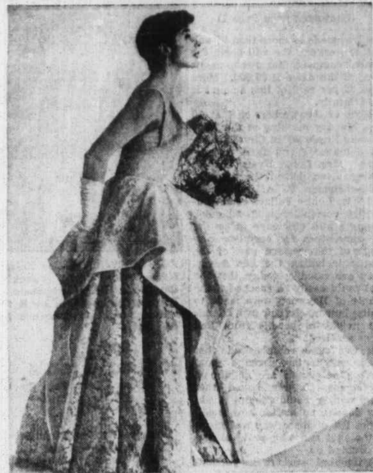
PARIS LIKES LACE LOOK Here are two gowns from the Paris spring collection, illustrating the season's trend toward lace. At left is Jacques Fath's cocktail sheath in blue lace with a new exposure in the widecape-coller neckline. At right, a nostalgic evening gown in white lace with overskirt banded in pink grosgrain ribbon, designed by Jean Desses.