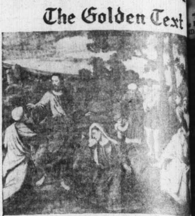
Raising of Lazarus

Costa Rica means "Rich Coast." Scotland Yard men.