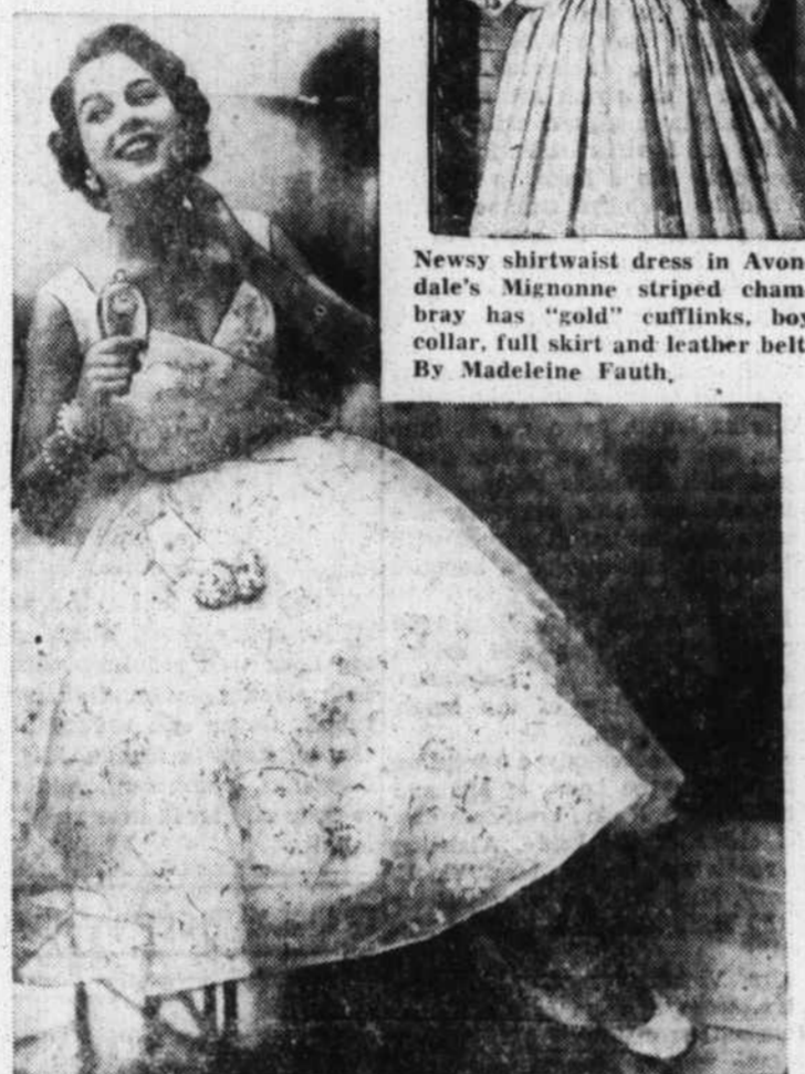
Perfect for proms, white organdy dance dress with pink embroidered flowers. By Rappi. Cologne is lighthearted Quelque Fleurs by Houbigant.