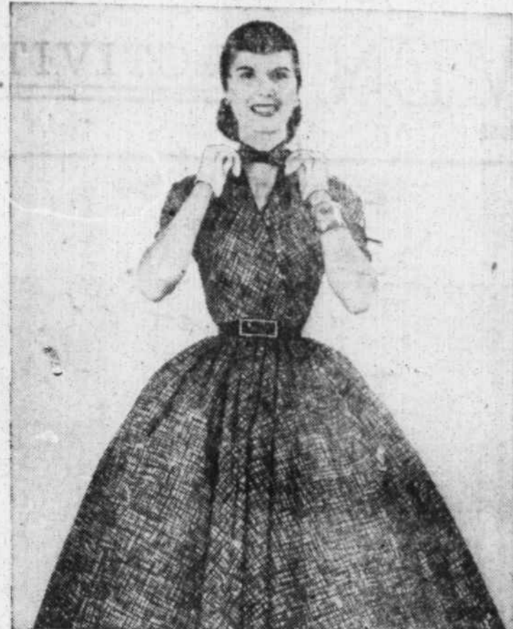
The look juniors love... this spring a coat style wrap dress with full shirred skirt and self bow tie. Grass prints on silk taffeta. By Anne Fogarty.