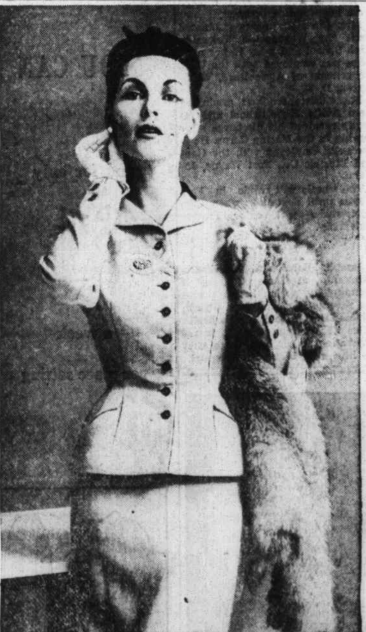
Dressmaker suit in tissue worsted, meticulously tailored, shows a Chesterfield touch via its black velvet collar. Contour silhouette features tiny envelope flap pockets molded to the hip. Scroll detail on lined jacket is centered with pearl and rhinestone cluster. By Harmay.