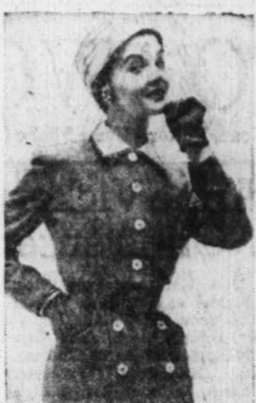
Sleeveless sheath dress wears cropped jacket with linen collar. In Milliken's grey flannel. By Georgette Juniors.