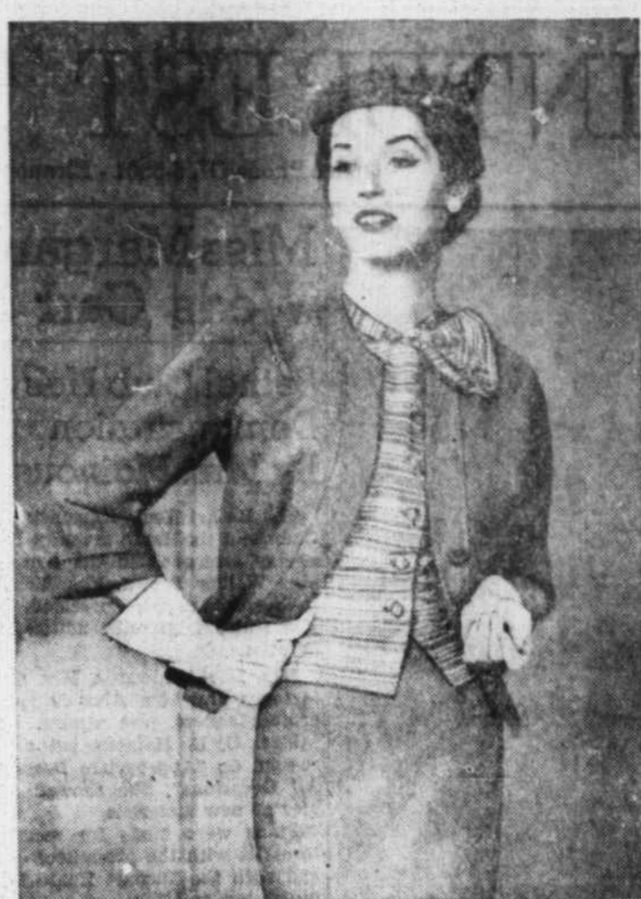
Costume suit of grey sheer wool with grey and white silk taffeta over blouse. Cardigan jacket is well-seam bordered and has little crescent pockets at the shoulders. By Adele Simpson. Suggested by N. Y. Dress Institute.