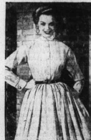
Newsy shirtwaist dress in Avondale's Mignonne striped chambray has "gold" cufflinks, boy collar, full skirt and leather belt. By Madeleine Fauth.